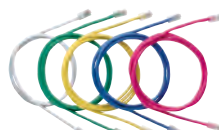
NK5EPC ^ *Y