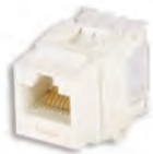
NK6X88MIW NK688MIW NKP5E88MIW