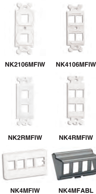
NK2106MFIW NK4106MFIW NK2RMFIW NK4RMFIW NK4MFIW NK4MFABL